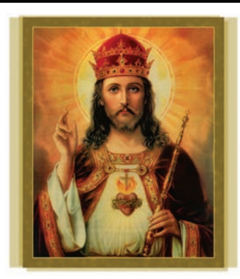
Today, we celebrate The Solemnity of Christ the King. It reminds us that our true home is with Jesus and in the end when he comes again His glorious reign of love will be all and all. Vivat Cristus Rex! Long live Christ the King!!