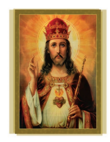
Today, we celebrate The Solemnity of Christ the King. It reminds us that our true home is with Jesus and in the end when he comes again His glorious reign of love will be all and all. Vivat Cristus Rex! Long live Christ the King!!!