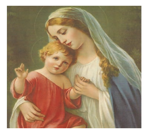
We will celebrate a Marian Mass for all Families on Tuesday, May 23<sup>rd</sup>, at 7:00 pm.

Baptism opens wide the font of Christ's divine mercy. In union with Christ, we grow in charity, having access to all the graces in His Most Sacred Heart, and as full members of His body, the Church, can partake in the Eucharist and all the other Sacraments which unite us more and more closely to Him. This brings us a joy and comfort that the world cannot give and which grows deeper as we grow closer to Jesus until we too are with Him in Heaven and our joy is complete.